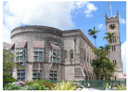
Figure 2: Photo of the Careenage.

Figure 3: Photo of the Parlaiment Building.